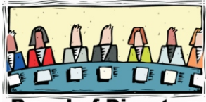
Board of Directors

Personal information contained in this newsletter is intended for Emmaus activities only, and will not be released to other organizations for any reason.