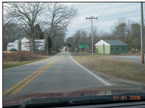
Rt 6 & Rt. 425 Intersection