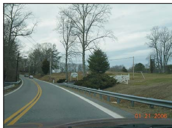
Entrance to Melwood