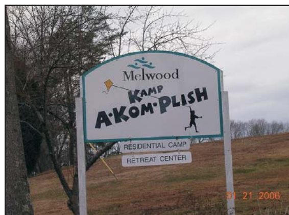
Closeup of Melwood Sign